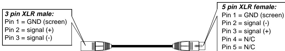
The above figure shows the cable to connect from 3-pin output on Martin fixture to 5-pin DMX input (P/N 309163).